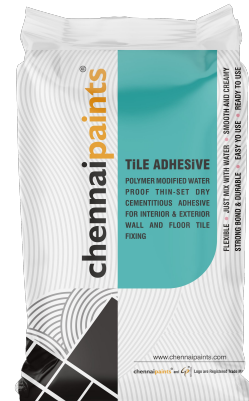
Pack Size 20Kg

Chennai paints- Grey Premium Tile adhesive is a high polymer, modified cement-based adhesive which is smooth & creamy, sanded bagged cementations powder with a high performance dry Thin set adhesive for use with water for installing in dry area for Small format ceramic wall & floor tiles, vitrified tiles, precast terrazzo and natural stones in Interior floor area and Wall up to a height of 10 Feet . It can be applied on Exterior Floors and Can be used up to maximum of 12mm bed thickness.