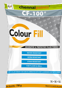
Part C Filler Powder